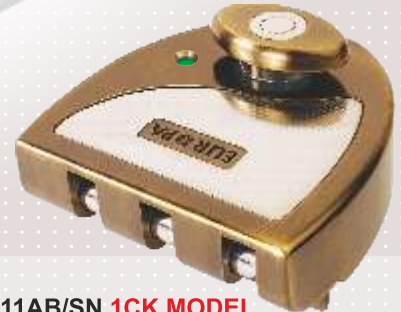
V311AB/SN 1CK MODEL