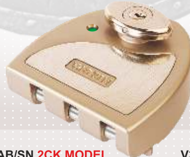
V321AB/SN 2CK MODEL

with India's Finest Interlocking Technology